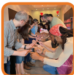
Communication Skills Training