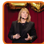
Speaking / Book