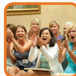
Women Empowering Women Seminars