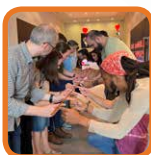
Communication Skills Training