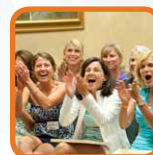
Women Empowering Women Seminars