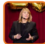
Speaking / Book